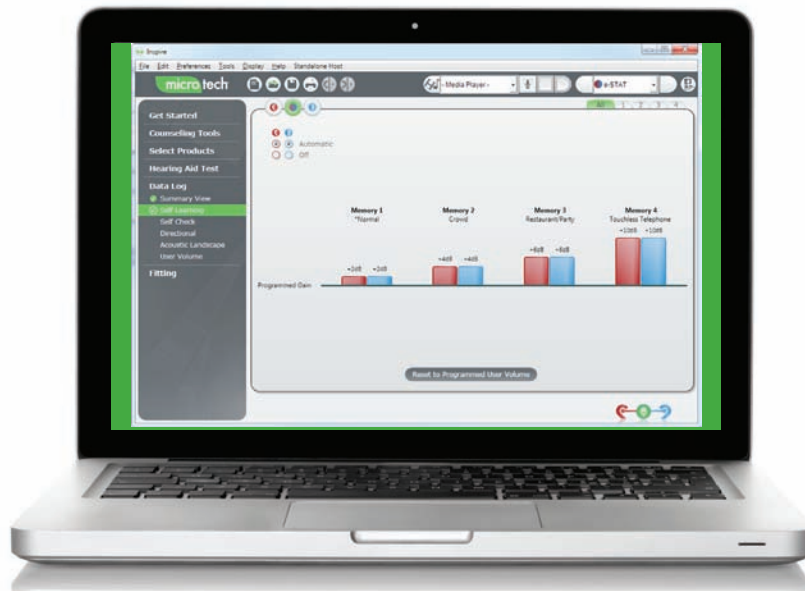
Figure 3: Self Learning screen in Inspire.

Self Learning can be set to either “Off” or “Automatic” on the Self Learning screen. When the feature is set to “Automatic,” learned changes are applied to the instrument and are visible to the clinician the next time the instrument is connected to Inspire. The learned changes can be removed on the Self Learning screen, if desired, returning the Power On gain to the previously programmed level. The ability to remove learned changes is available independently for each Memory Environment.