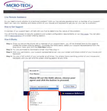
Representative drop down menu

5) Download the necessary software to run the program. This step may not be required if the software is already installed.