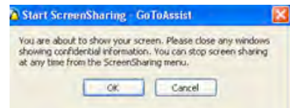
Screen sharing message

6) Make sure that all sensitive documents are closed prior to allowing the screen sharing. You are granting full control of your computer. At any point in time, you have the ability to end the session.